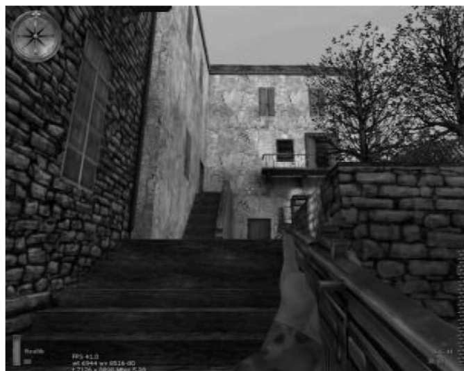
FIGURE 1: A typical first-person shooter game.

This paper examines pan-based target acquisition in 3D first-person computer games. The aim is two-fold: first, to verify that Fitts' Law accurately models this type of target selection; and second, to compare user performance with traditional pointing and pan-based pointing. If there is little difference between traditional and pan-based pointing, there is an argument supporting the use of 3D game environments for motivating participants in longitudinal Fitts' Law studies.