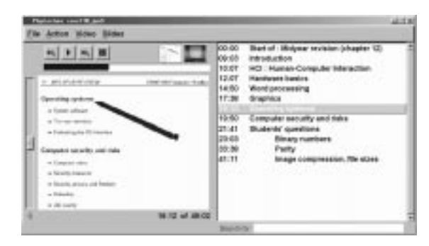
Figure 2: Zoomed into the overhead slide.

Various controls allow the user to freely navigate through the lecture. As well as the normal 'fast-forward' and 'rewind' controls, the user can click on the time-line (beneath the control-buttons) to jump to a particular time in the lecture. Also, the right-hand side of the interface provides a hypertext keyword index to the lecture. Clicking on an item in the list causes the video and audio streams to immediately jump to the associated part of the lecture.